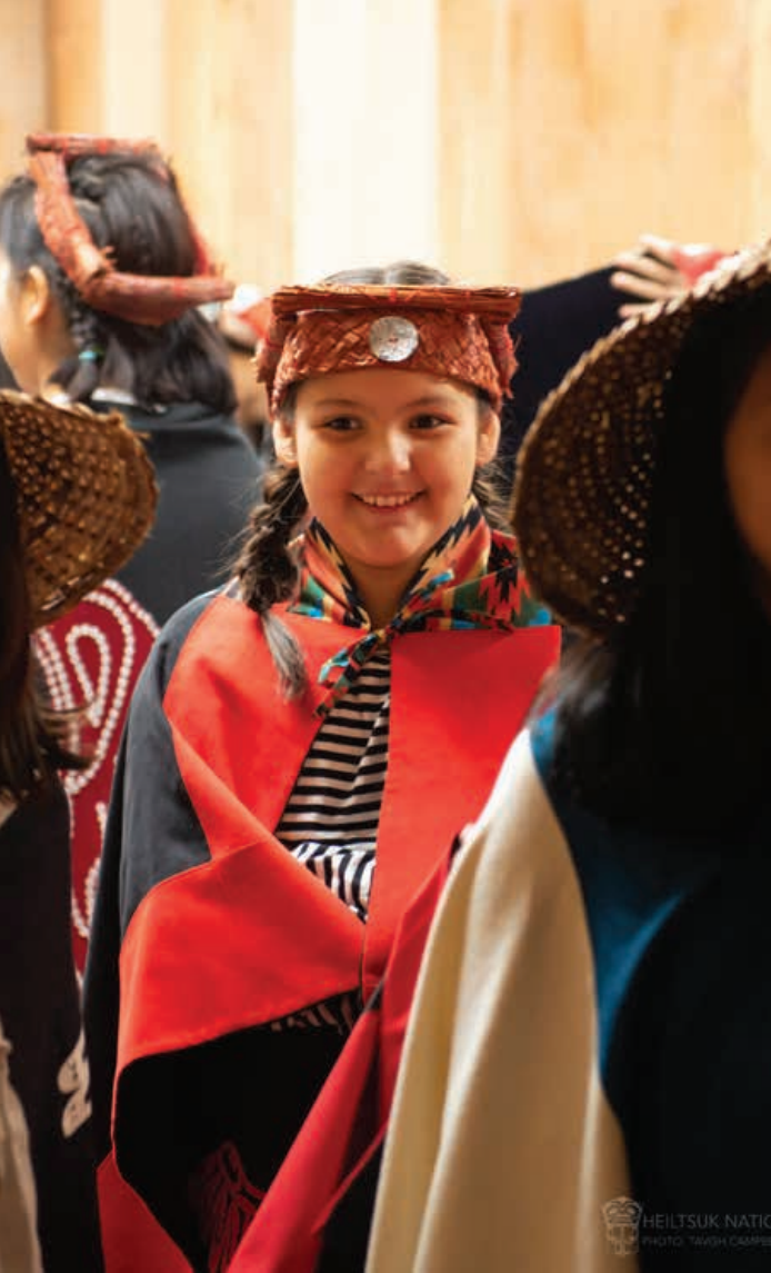
HEILTSUK NATION PHOTO: TASHI CAMPBELL